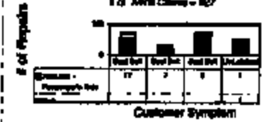
2001 Expedition / Navigator Pass. Side Not Latched Mar-01/02 A. Driver's Side vs Passenger's Side Total # of AWS Claims = 82