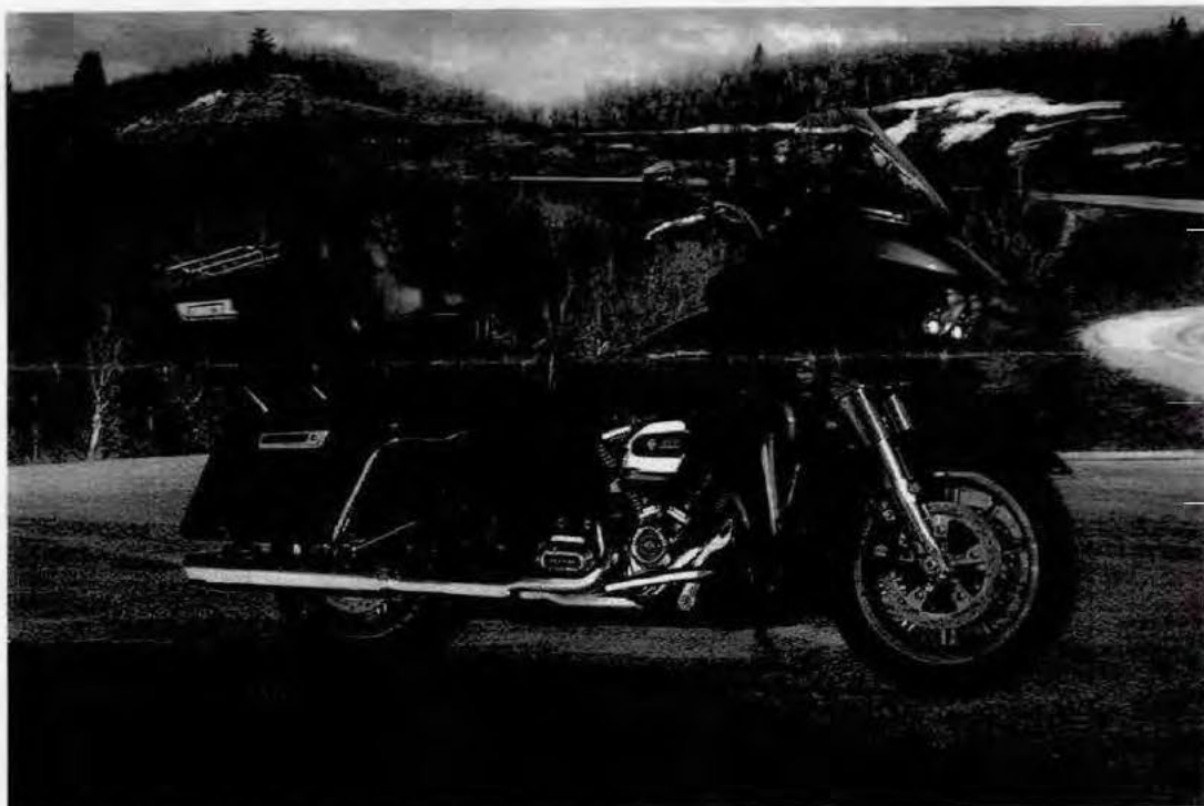
2018 Harley-Davidson Road Glide Ultra