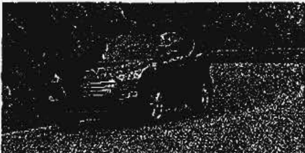
Hyundai Fined Millions over Engine Recall Response