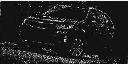
Hyundai, Kia Recalling 591,000 Vehicles

Owners will be notified of the recall beginning on January 22, 2021, to bring their vehicles to a Hyundai dealer. If the dealer finds bearing damage, the engine will be replaced. Dealers will also install a new Knock Sensor Detection System (KSDS) through a software update; the system will monitor engine vibrations to detect premature wear or damage.