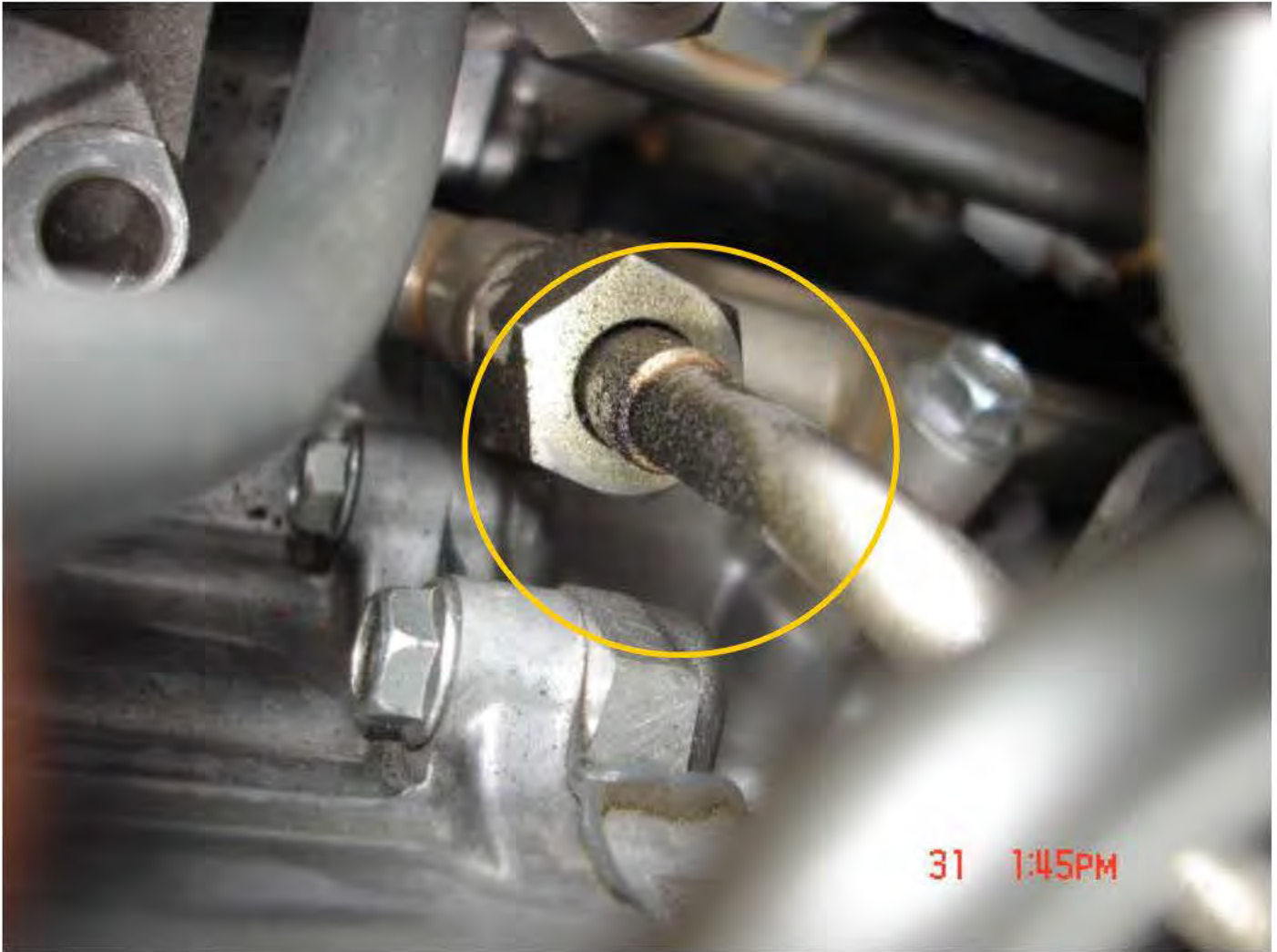
High pressure fuel line fittings are leaking fuel