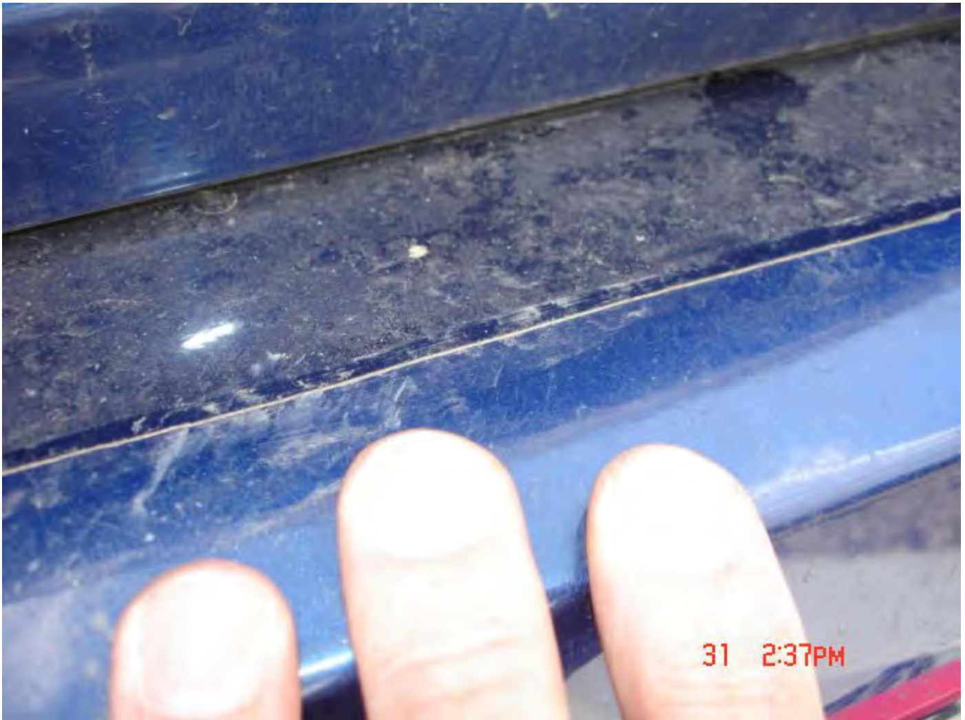
Cracked paint on rear bumper cover top horizontal position