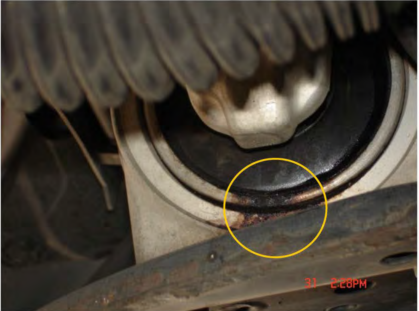
Right front (aft) lower control arm bushing is failing