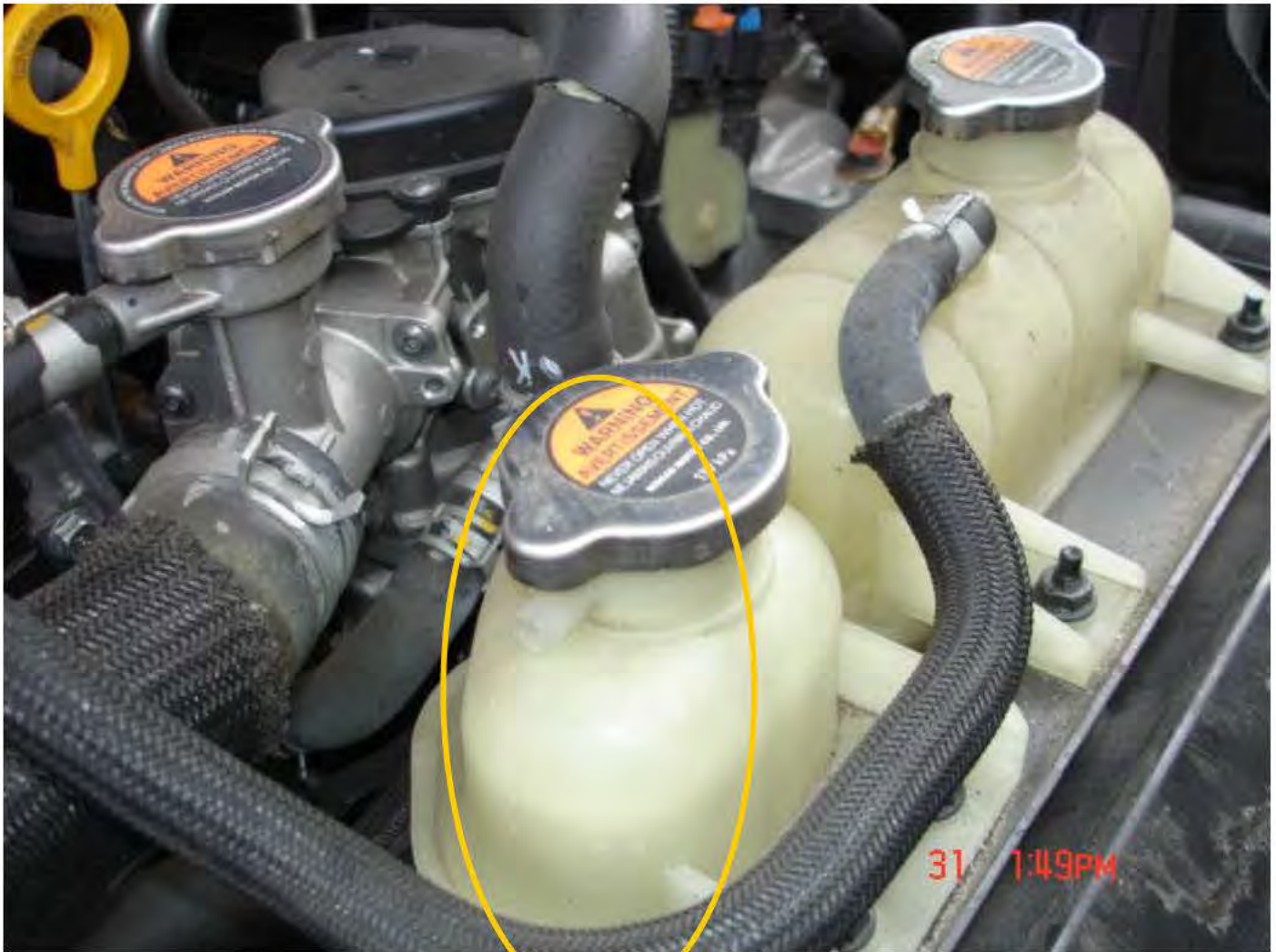
Heat exchanger coolant reservoir is empty