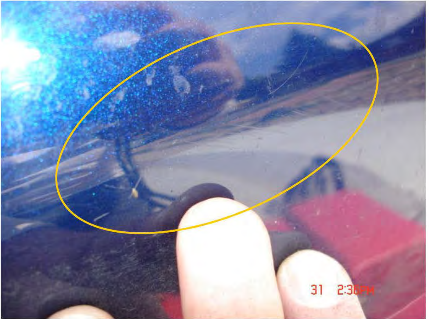
Scratches on rear bumper cover vertical portion