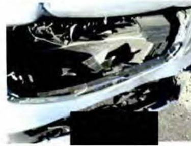
12/19/2017 E01 Comments: