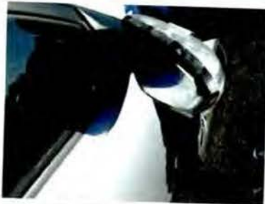
12/19/2017 E01 Comments: