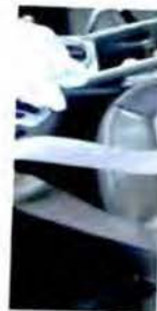
12/19/2017 E01 Comments: