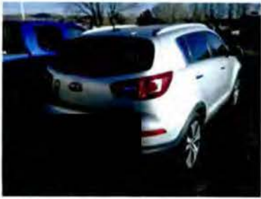
12/19/2017 E01 Comments:

Owner: [REDACTED] Insurance: CUSTOMER PAY Estimator: Ste RO Number: [REDACTED] Claim Number: Year: 2011 Color: GRAY License Plate: [REDACTED] Make: KIA Body Style: 4D UTV State: CO Model: SPORTAGE 4X4 EX Engine: 4-2.4L-FI VIN: KN