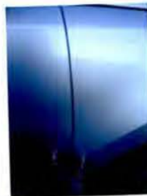
12/19/2017 E01 Comments: