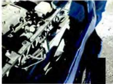
12/19/2017 E01 Comments: