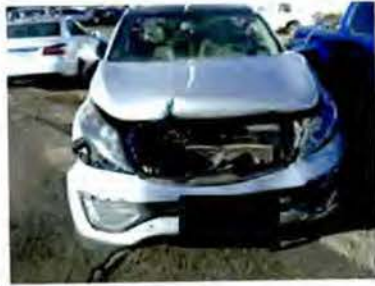
12/19/2017 E01 Comments:

Owner: [REDACTED] Insurance: CUSTOMER PAY Estimator: S RO Number: [REDACTED] Claim Number: Year: 2011 Color: GRAY License Plate: [REDACTED] Make: KIA Body Style: 4D UTV State: C Model: SPORTAGE 4X4 EX Engine: 4-2.4L-FI VIN: K