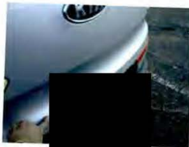
12/19/2017 E01 Comments: