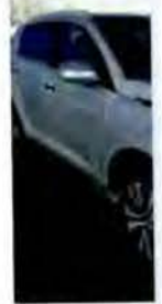
12/19/2017 E0 Comments: