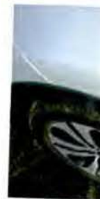
12/19/2017 E01 Comments: