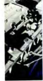
12/19/2017 E0 Comments: