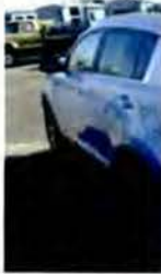
12/19/2017 E01 Comments: