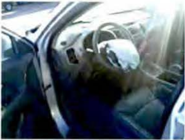
12/19/2017 E01 Comments: