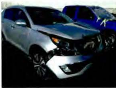
12/19/2017 E01 Comments: