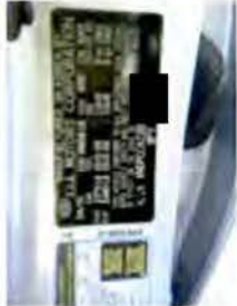
12/19/2017 E01 Comments: