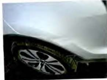
12/19/2017 E01 Comments:

4D UTV State: CO Mileage (M): 44,704 4-2.4L-FI VIN: KNDPCCA22B7 [REDACTED] Condition: