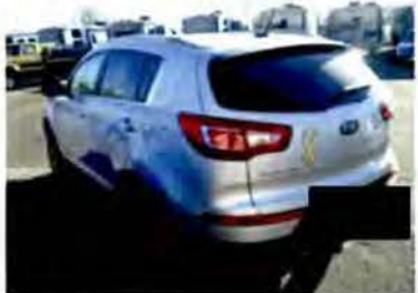
12/19/2017 E01 Comments:

CUSTOMER PAY Estimator: Steve Calu Vehicle Out: GRAY License Plate: [REDACTED] Production Date: 4/2011 4D UTV State: CO Mileage In: 44,401 4-2.4L-FI VIN: KNDPCCA22B7 [REDACTED] Condition: