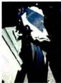
12/19/2017 E01 Comments: