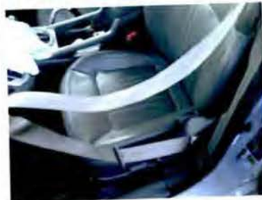
12/19/2017 E01 Comments: