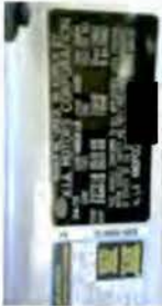
12/19/2017 E01 Comments: