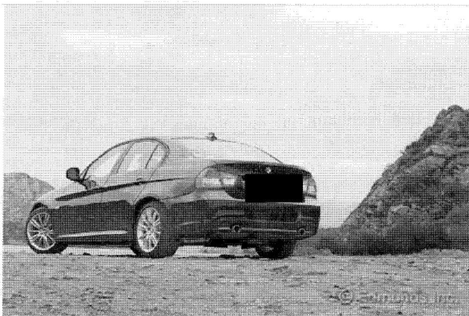
2010 BMW 335i Picture

BMW of North America is recalling 156,137 2010-'11 vehicles, including the BMW 335i sedan, because loose bolts could lead to engine stall. | April 29, 2014 | Scott Jacobs for Edmunds