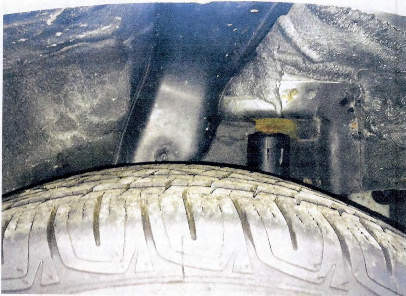
LEFT FRONT SHOCK