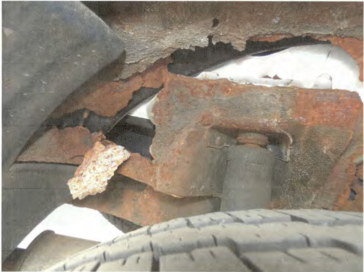
This photograph from a slightly different angle clearly shows the damage on our 2005 Ford Escape Hybrid.