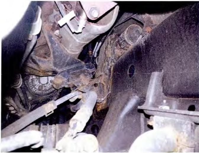
Engine compartment, undercoating failing.