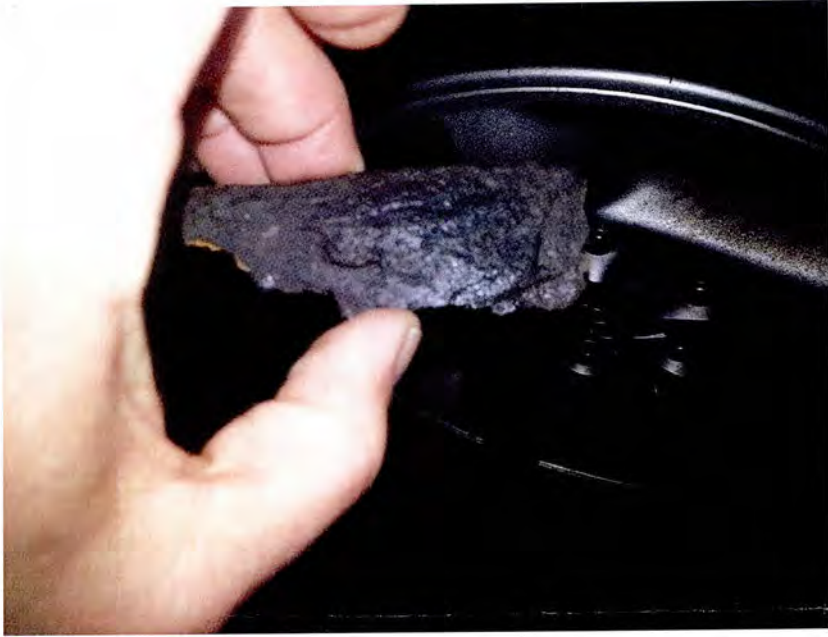
One of many large pieces of undercoating failing.