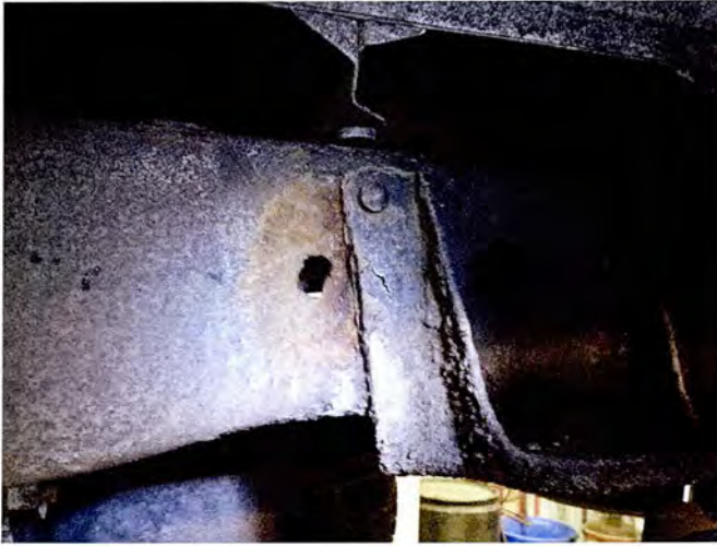
Hole in frame. Undercoating Failing