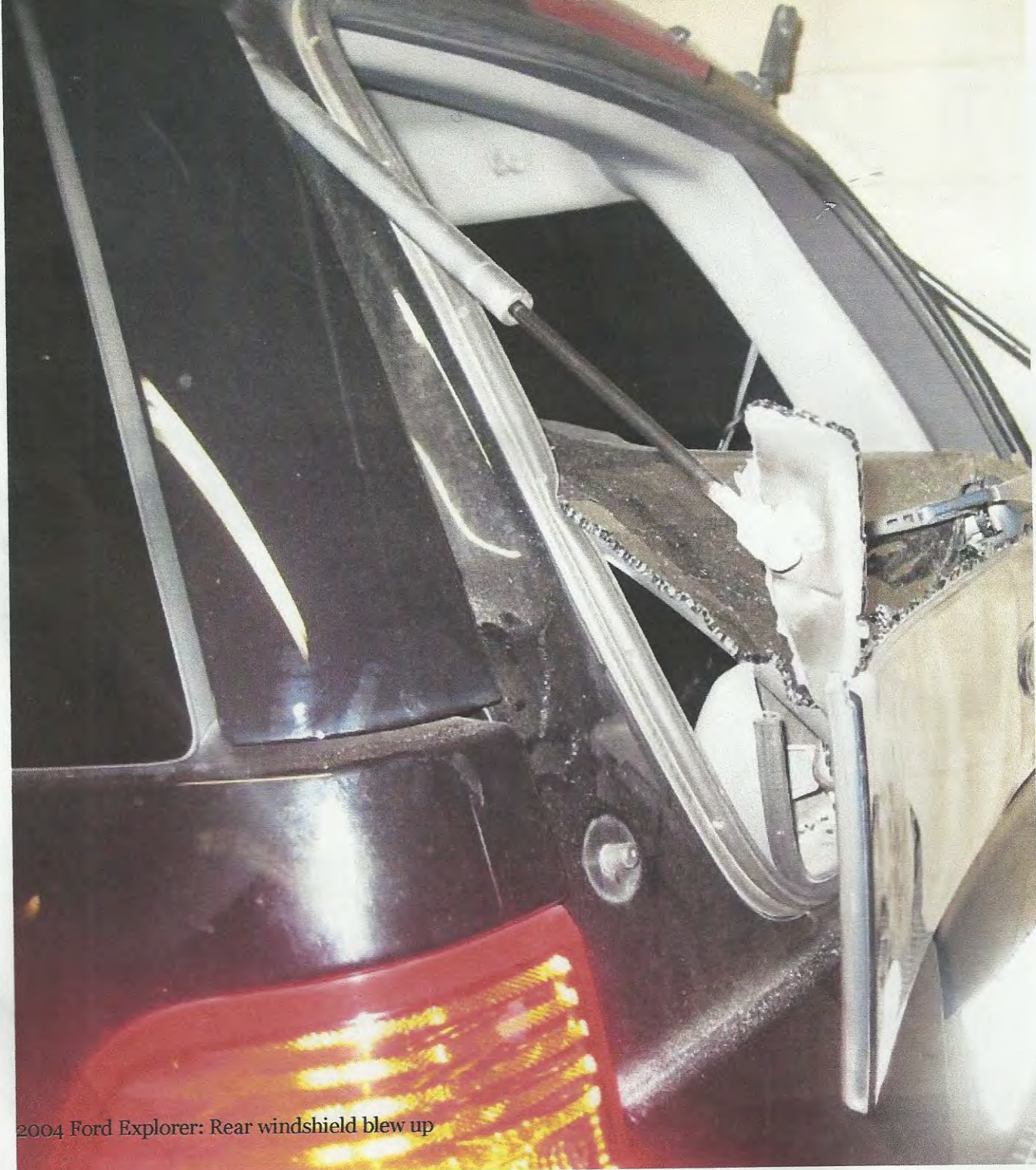
2004 Ford Explorer: Rear windshield blew up