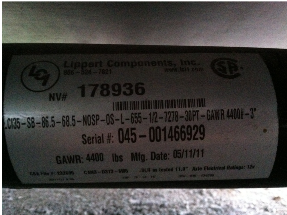
Front Axle Label

Owner provided photos for VOQ 10480773 11-7-12