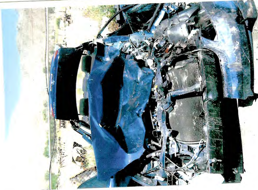
# 3 Toyota Corolla