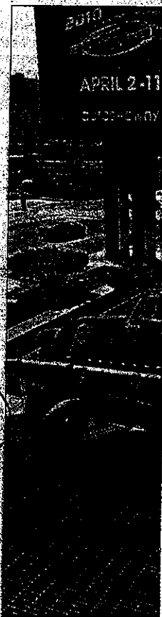
Chrysler is recalling about 289,000 Jeep Wrangler amid brake