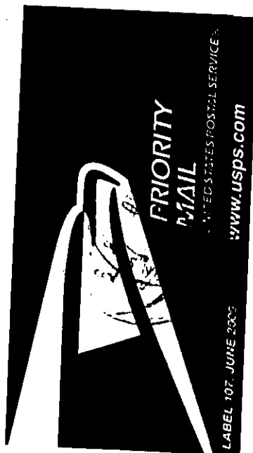
Photo Document Mailer