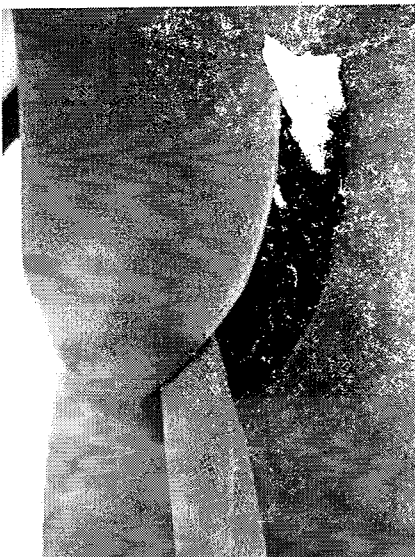
View with trim package attached.