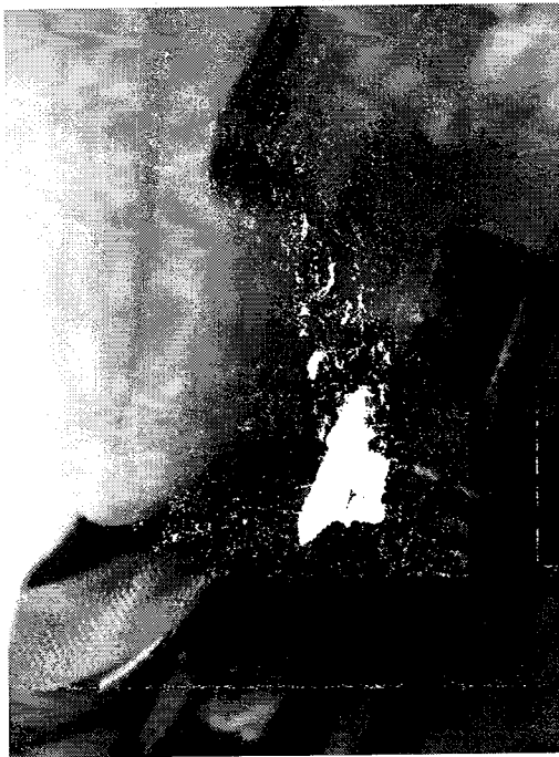
Belt folded over in guide.