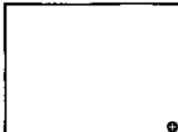
Dodge Dakotas

As CBS News first reported in October, the government is investigating another Dodge vehicle, the Durango, after receiving an unusually high number of complaints of premature wear on the upper ball joints.