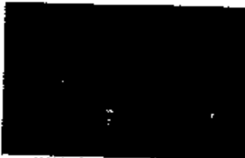
Vehicle photos courtesy of Edmunds.com