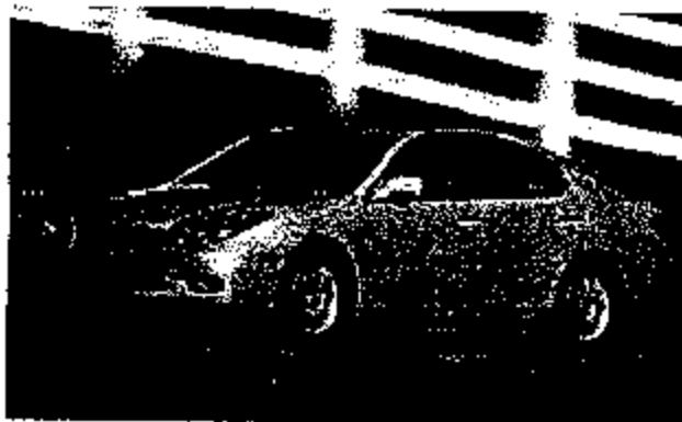
Some drivers have reported acceleration surges in the Lexus ES 300 and other vehicles made by Toyota Motor Co.

WASHINGTON — The federal government is investigating reports that some Toyota Camry, Camry Solara and Lexus ES 300 vehicles have surged forward without apparent reason, injuring at least five people.