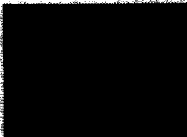
scratches and dents